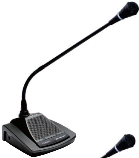
Tabletop discussion chairman unit CR-M4102B